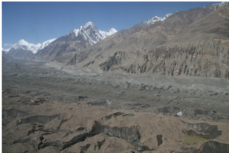
Fig. 2: Fedchenko Glacier, Tajikistan, Pamirs.

This research highlights the challenges associated with understanding these anthropogenic cryospheric features, as well as key operational and geotechnical questions that remain to be tackled. For instance, there are currently no suitable disposal methods or water treatment facilities to prevent meltwater from degrading the environment.